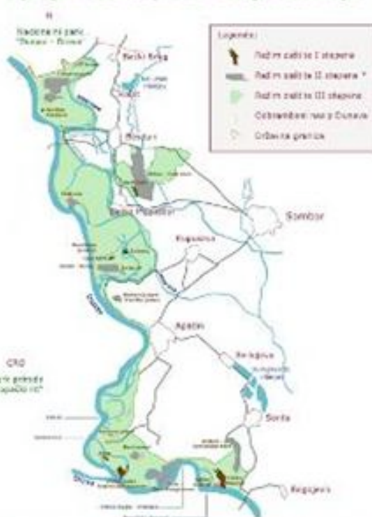
Specijalni rezervat prirode "Gornje Podunavlje"

* Poređivanje prema broju stanovnika u skladu sa podacima iz popisa stanovništva iz 1980. godine.