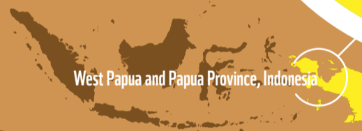
West Papua and Papua Province, Indonesia