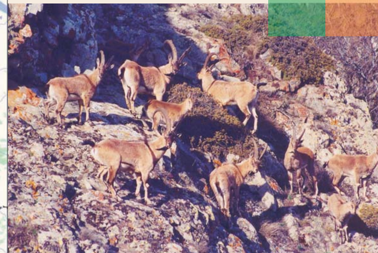
Bezoar goats in the planned "Arevik" National Park