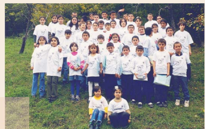
Schoolchildren-participants of Leopard Education Program (Shikahogh village)

WWF believes that business, trade, and industry have a crucial role to play in supporting conservation efforts and promoting greater environmental responsibility for our planet. WWF strives to build environmental awareness by working with businesses to help improve their environmental performance, as well as boost their economic bottom line. Governed by the principle Good for the Earth, Good for Business , WWF-Armenia is committed to partnering with companies who are willing to become a WWF Conservation Partner .