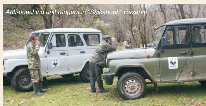
Anti-poaching unit rangers in "Shikahogh" Reserve