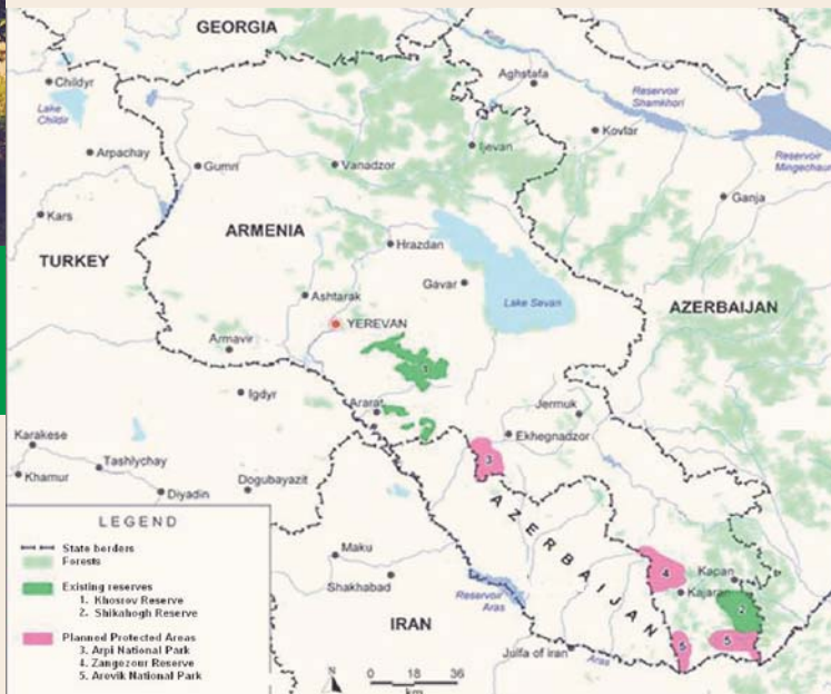
Existing and planned protected areas where WWF-Armenia works

Unique biodiversity of Armenia is conditioned by existence of a wide array of landscape zones (deserts, semideserts, mountainous steppes, forests, sub-alpine and alpine meadows) as well as wetlands and freshwaters.