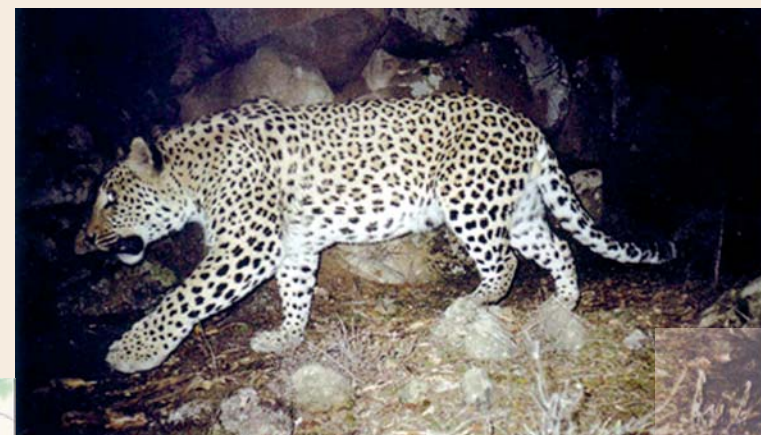
Caucasian leopard (taken by camera trap in Southern Armenia)

WWF initiated and coordinated the development of an Ecoregional Conservation Plan (ECP) for the Caucasus, a comprehensive strategy for the region that was endorsed by the Environmental Ministers of the South Caucasus countries (Armenia, Azerbaijan, Georgia) during the Ministerial Conference (Berlin, 2006).