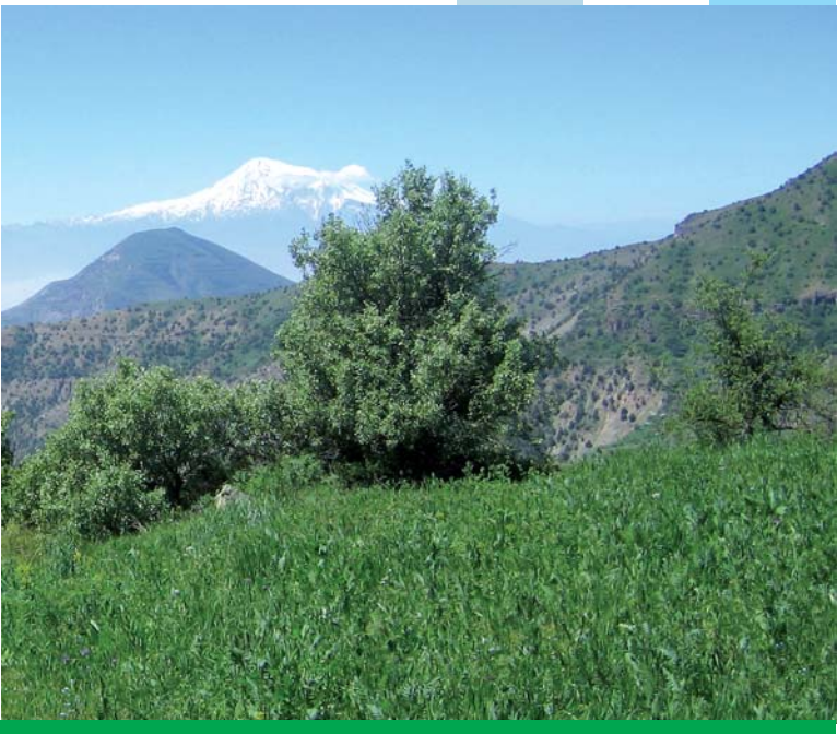
View to Mt. Ararat from "Khosrov" Reserve