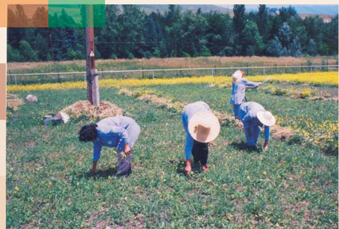
Promoting alternative livelihood in rural communities