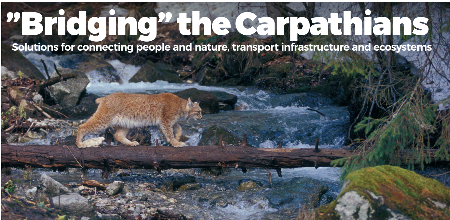
Lynx lynx ©Tomas Hulik