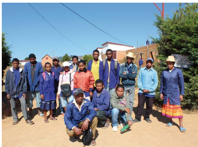
Class representative in Fandriana