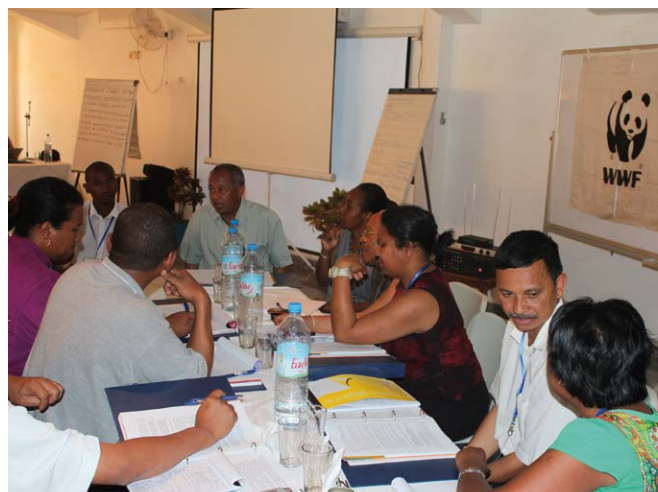
Capacity reinforcement of curriculum developpers from the ministries of education and vocational training

A first draft of a reference document on education for development in schools has been developed in partnership with the relevant Ministries. This document links up the conceptual framework to the actual reality and practice by presenting the expected results on the short and long term. A committee was set up in order to study in detail the integration of sustainability into the national education policies in place on the one hand, and the training documents of the agents of the ministry, which are being drafted, on the other.