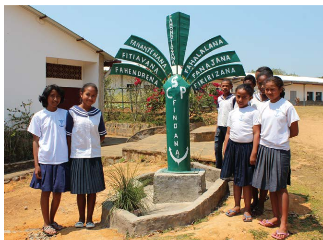
The values promoted within the Saint Paul secondary school in Ifanadiana

Each model school has its own specific settings: the living conditions of students, availability and personal commitments of teachers, local values and cultures, local issues, .... The educational community consisting of parents, local authorities, teachers and students have identified together and studied the key values to be acquired by students during the school year. Indeed, parents were pleasantly surprised to learn that teaching values is now part of the education at the schools. To start the approach, each school has chosen one value for the school year.