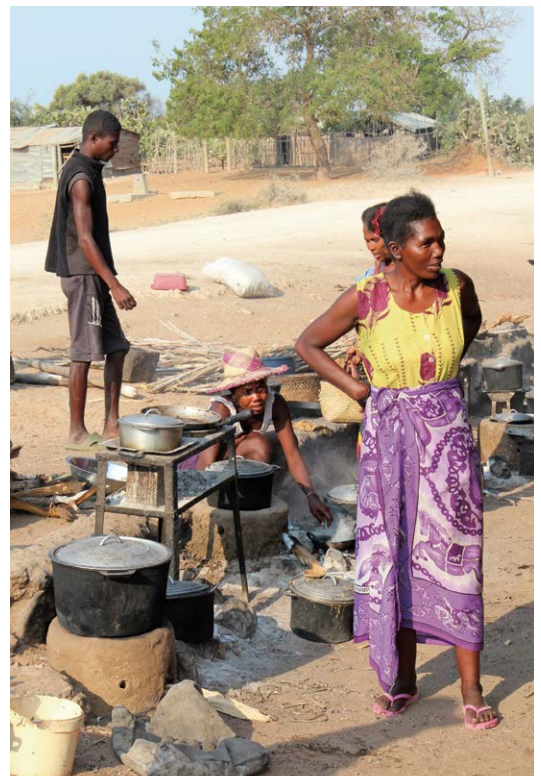
Owner of a greasy spoon at the market place using the energy efficient stoves made by the students from the secondary school