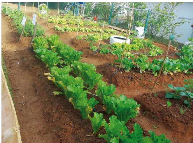
Micro-gardening and micro-irrigation in the site for demonstration

“A site for the demonstration of a micro-garden re-using waste has been set up at the Vondrozo high school. This site helped us learn about new techniques for fighting against insects using organic methods and it has also helped us learn about new varieties of vegetables such as peas. The Vondrozo high school has introduced this vegetable to the local community and they were the first to sell peas at the market place” - Dera –Vondrozo high school