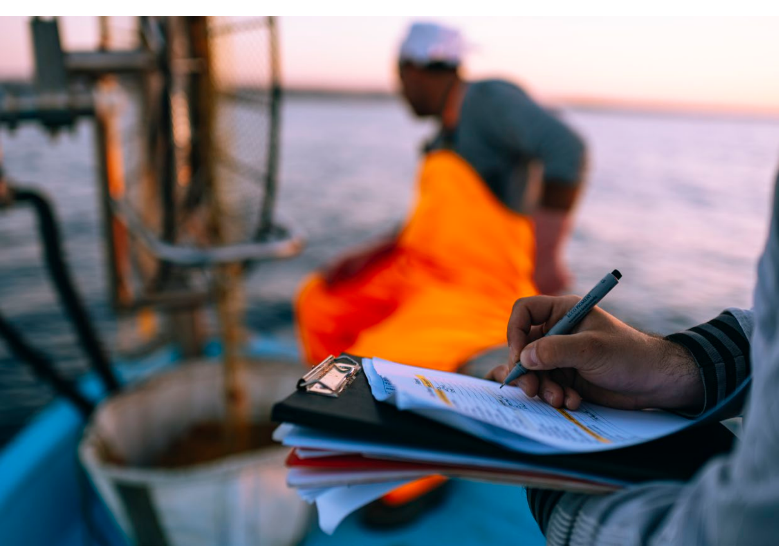
Scientist scribing observations on fishing vessel

Before signing a mixed SFPA, the EU and coastal States should ensure that scientific data has been collected to demonstrate the existence of a "surplus" of marine resources (from a biological point of view) that the EU may access. Quantitative, qualitative and gender disaggregated data should also be compiled on the socio-economic aspects of the fisheries, including: employment generated in the fisheries value chains, contribution to national nutrition needs, level and repartition of income along the value chain, employment conditions, etc.