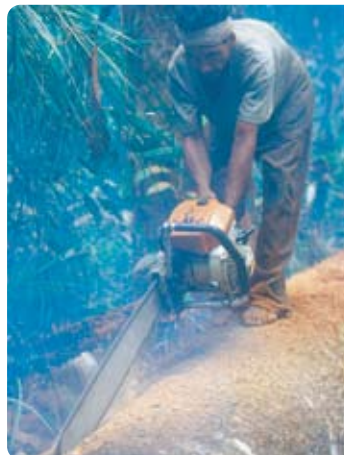
Illegal logging, Sumatra, Indonesia.

This habitat loss not only reduces the available living space for rhinos. It also isolates and fragments rhino herds, making reproduction and genetic mixing difficult to impossible.