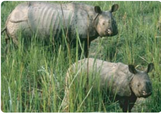
Greater one-horned rhino, Royal Chitwan National Park, Nepal.