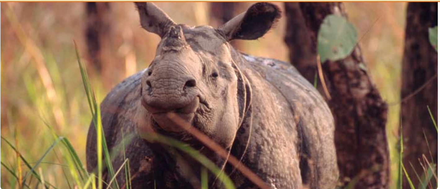
Greater one-horned rhino, Royal Chitwan National Park, Nepal.

The Terai Arc Landscape is part of the Terai-Duar Savannas and Grasslands Ecoregion — one of WWF's Global 200 Ecoregions, biologically outstanding habitats where WWF concentrates its efforts.