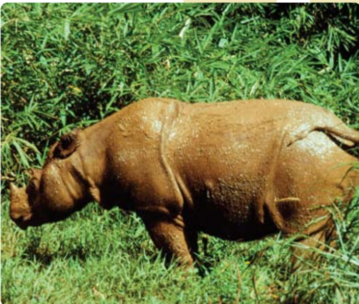
Sumatran rhinoceros.

7. Throughout all rhino habitats, WWF and TRAFFIC monitor the illegal trade in rhino horn, fund anti-poaching patrols, and support intelligence networks in strategic locations to prevent over-exploitation of rhinos for international trade. Work is also ongoing with practitioners of traditional Asian medicine to find and promote alternatives to rhino horn.