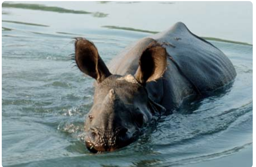
Young greater one-horned rhino.

Historically hunted for their horn, a prized ingredient in traditional Asian medicines, and devastated by the destruction of their lowland forest habitat, Asian rhino populations are now distressingly small. These animals are among the world's most endangered, with one species numbering only around 60 individuals. Throughout their range, their habitat continues to dwindle fast due to illegal logging and other human pressures, and the threat of poaching is ever-present.