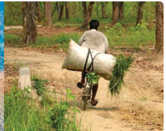
Local resident carrying off grass harvested from Terai Arc Habitat, Nepal.