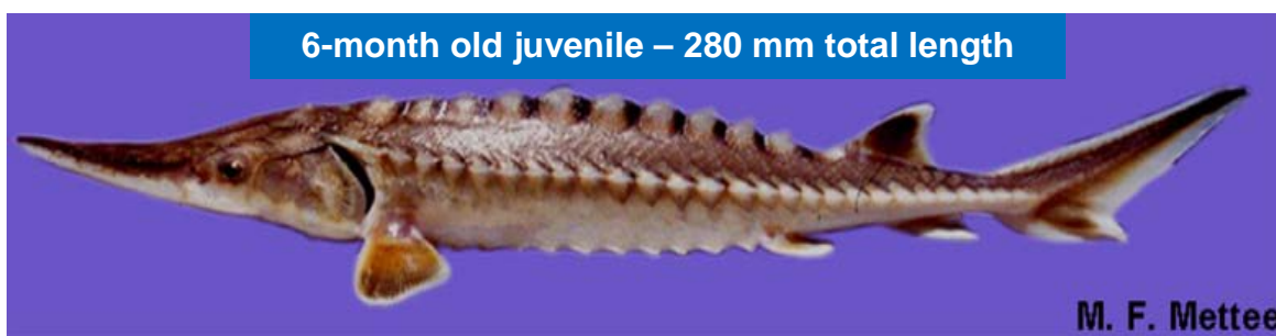
Gulf Sturgeon Acipenser oxyrinchus desotoi

* Corresponding Author: mrandall@usgs.gov