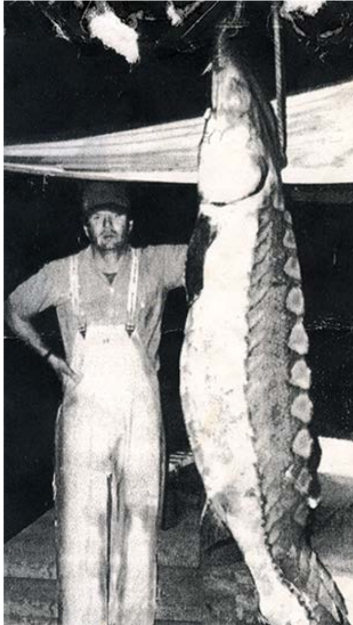
Gulf Sturgeon - Lake Borgne, LA, 1978 – 387 lb